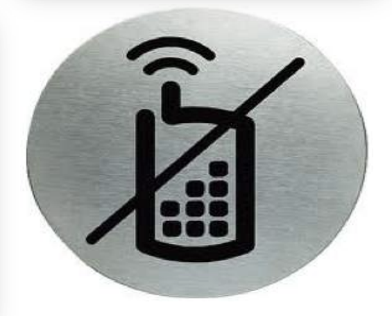
Respectful use of Mobile & Co